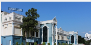
Dr. T. P. Ganesan Mini Hall Auditorium SRM University, Potheri, Chennai