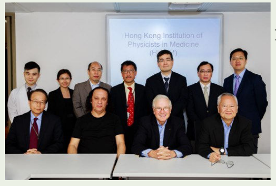
Fig. 3 Site review team with officers of HKIPM