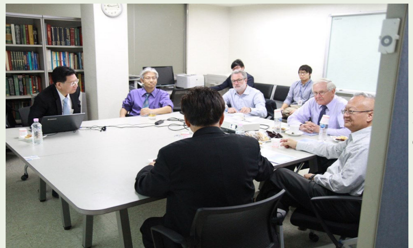
Fig 1. Site review meeting with faculty of one of the training sites in Korea