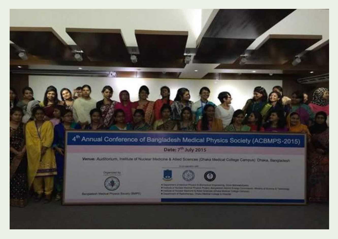
Participants at the ACBMPS-2015

In 2014 around 350 participants including 40 foreign cancer specialists (Bangladesh, China, UK, Germany, Italy, Mexico, Austria, Sweden, Australia, Canada, India, Sri Lanka, Indonesia, Lebanon, Japan, Nepal, Poland and Pakistan) joined the international conference that consisted 18 sessions.