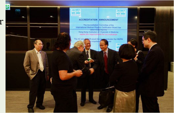
Fig. 4 Accreditation announcement at the Seminar organized by HKIPM